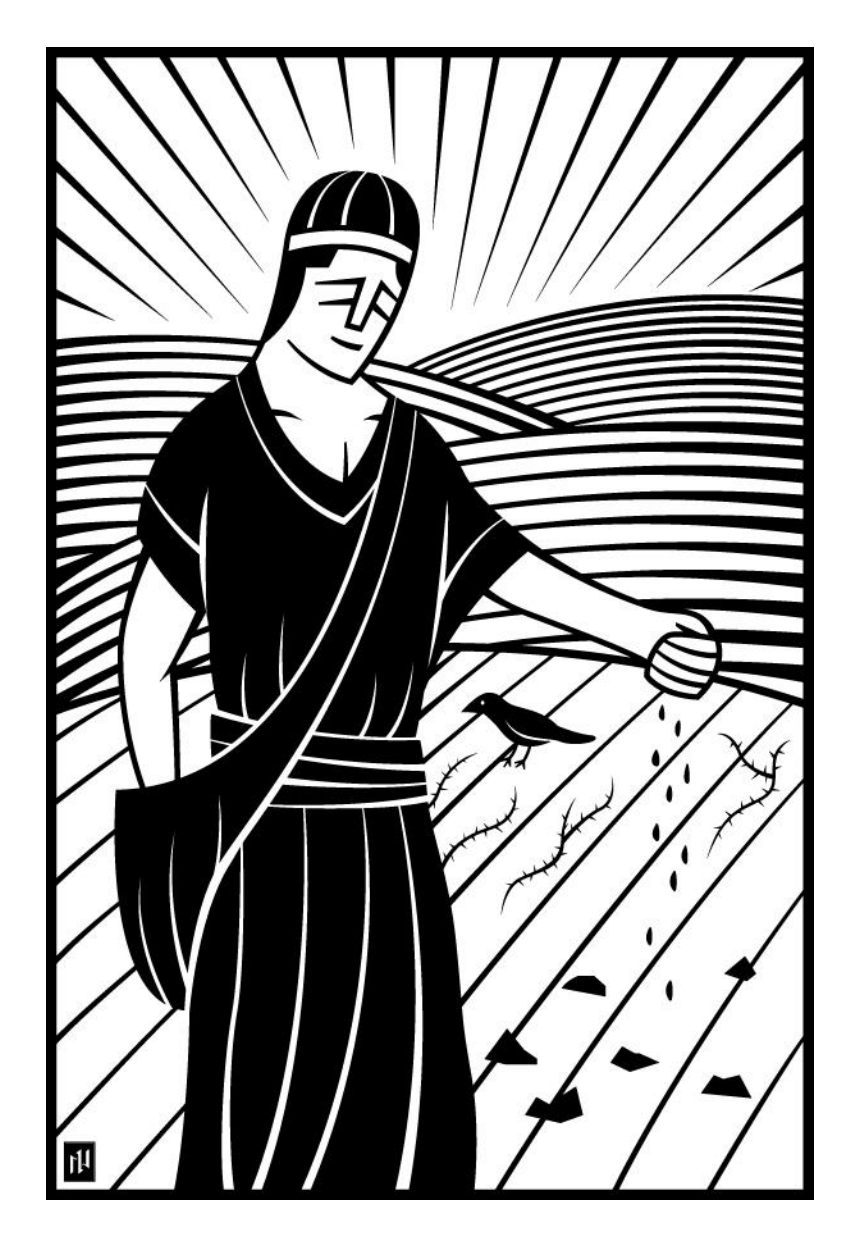
SHINING MOUNTAINS LUTHERAN CHURCH Bozeman, MT

The Eighth Sunday after Pentecost – July 26th, 2020